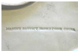
Impressed mark circa 1813-1820