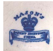
Printed mark in blue or black circa 1820-1830