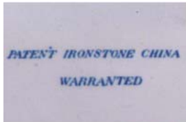
Printed mark circa 1813-1820