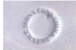
Impressed mark circa 1813-20