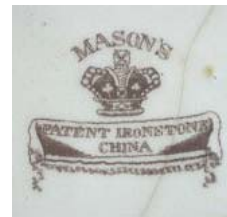
Printed mark circa 1835-1840