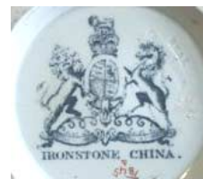
Printed mark from 1862